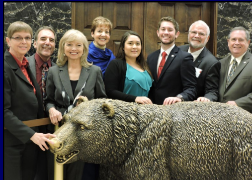
Governing Board members and district officials pose in the state Capitol.