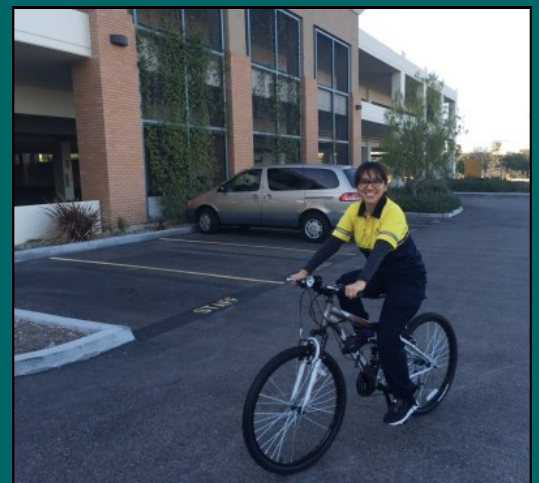
CAPS bike patrols are now at both colleges.